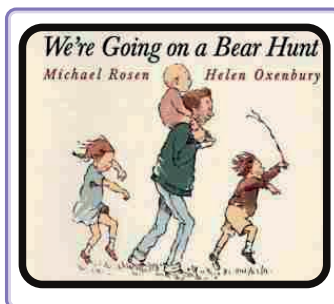
We're Going on a Bear Hunt By Michael Rosen