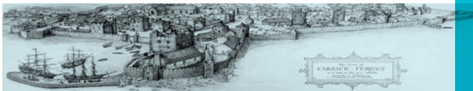
Artist's impression of Carrickfergus in 1620

While the town has evolved over successive centuries, several early period landmarks including the Castle, Saint Nicolas's Church and sections of the defensive stone town walls completed in 1615 remain to this day. However, the impact of 20th is particularly noticeable, when industrial development, house building and road infrastructure radically altered the character of the medieval town.