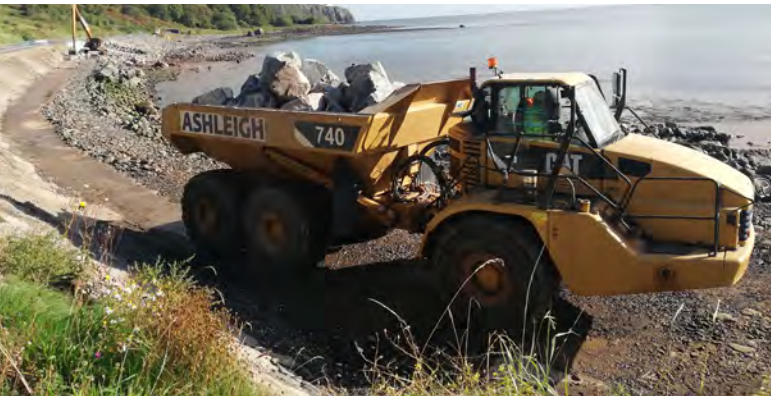
40 tonne dumper delivering rock armour stone