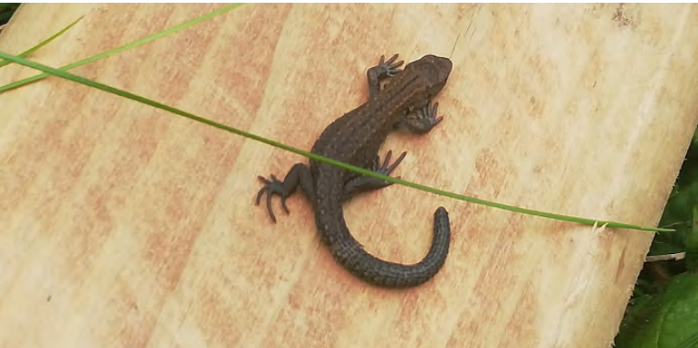
Common lizard sunbathing on some ply alongside the promenade