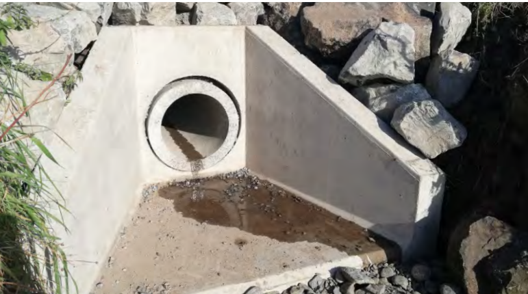
Culvert has been renewed with FP McCann Precast concrete headwall and pipes