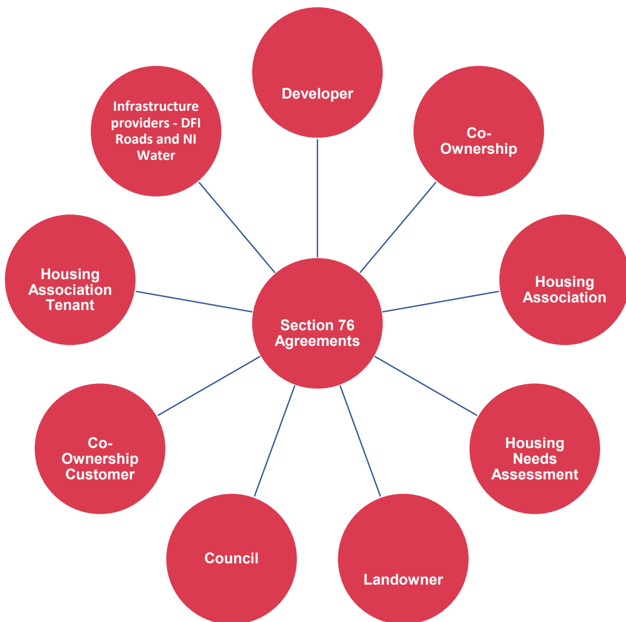
Figure 2 The parties interested in a section 76 planning agreement